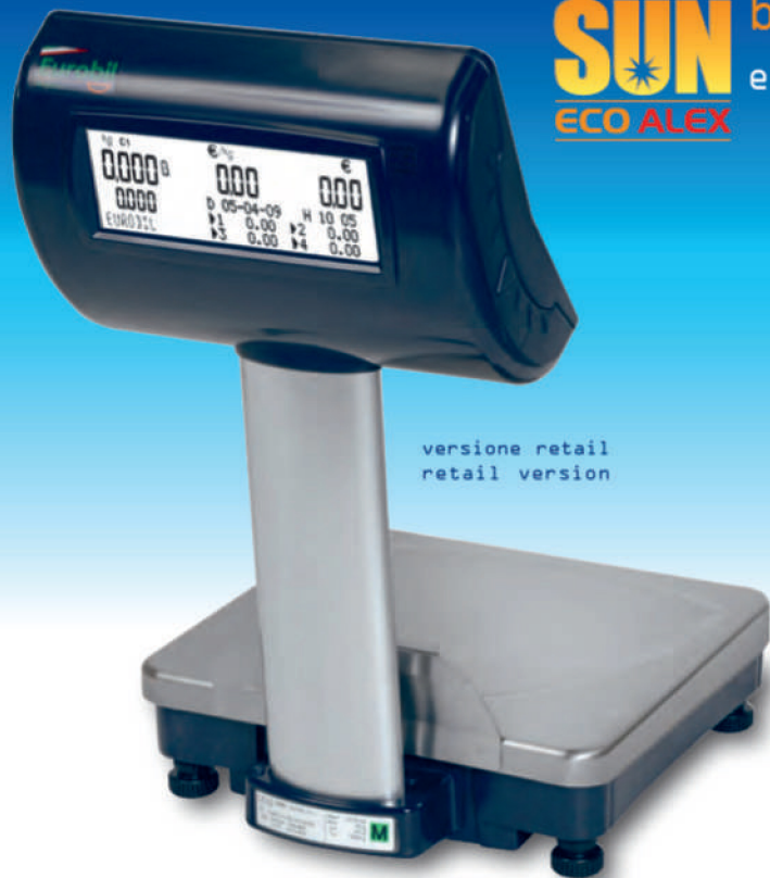
versione retail retail version